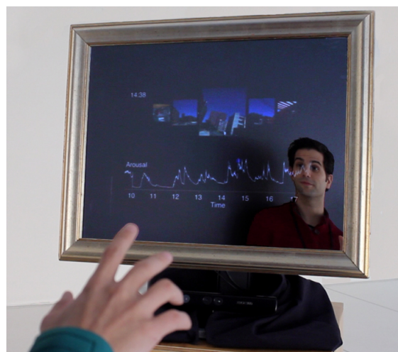
Figure 1. Inside-Out: A system for emotional reflection.

Continuously monitoring a person's contextual activity is closely related to the concept of life-logging, where a person utilizes passive capture devices to record and digitize his life. The advancements in this area can not only help researchers to better study human behavior, but can also provide insightful information for a wide variety of applications. For instance, the monitored person can visualize his daily